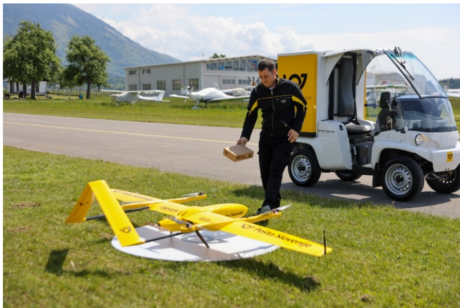
Figure 1: First trial flight with an unmanned aircraft for Post of Slovenia which delivered a package to the Poštarski dom mountain hut on Vršič