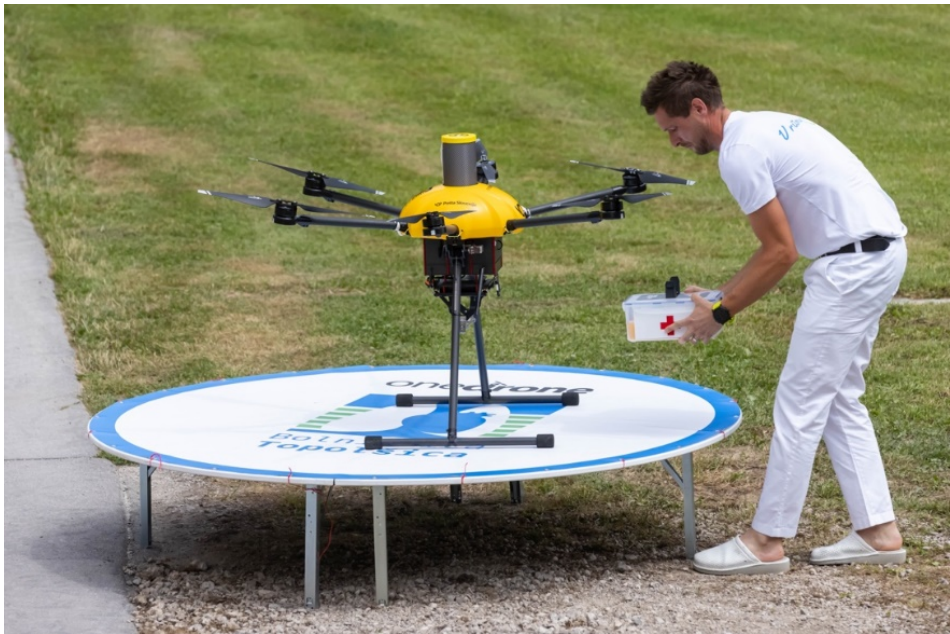
Figure 2: Delivery of blood samples from a remote health center by drone (multicopter).

The main advantages of using this type of vehicle include reduced pollution, optimization of logistics channels, quick deliverability of essential goods and materials to remote and difficult-to-access areas, etc. In addition, great potential can be found in supplying and delivering postal items to mountain posts and cabins, while collecting and removing waste on the way back to the valley. The same goes for emergency delivery of medicines and medical devices, which would fulfil the aim of remaining a relevant and comprehensive link between the Slovenian economy and the population.