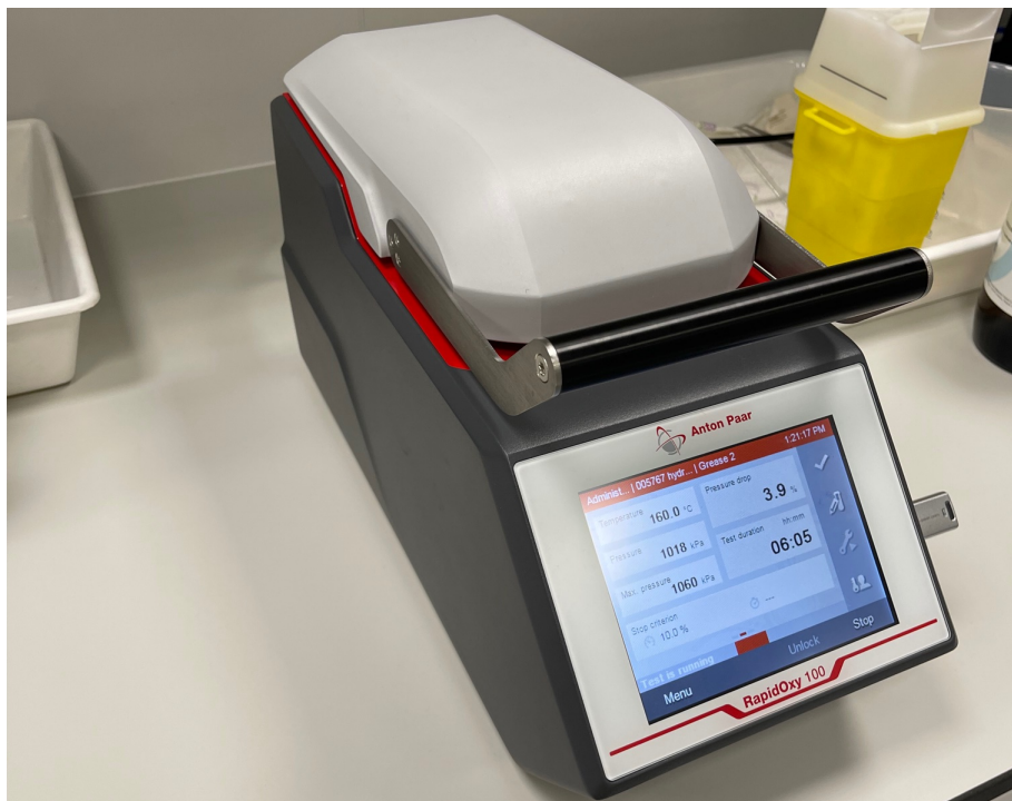
Figure 2: Oxidation Stability Tester: RapidOxy 100.

Oxidative stability of Hydrolubric HC VG 46 was measured in comparison with some other Olma mineral-based hydraulic oils ISO VG 46. The RapidOxy 100 tester shown in Figure 2 was used. The results are shown in Table 3.