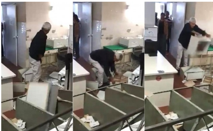
Figure 6: Jornal da Cidade

Recently, tired of complaining about the lack of resources to work, a 71-year-old physician from Cariacica, ES, Southeast of Brazil, had a psychiatry crisis and broke part of the public hospital where he worked.