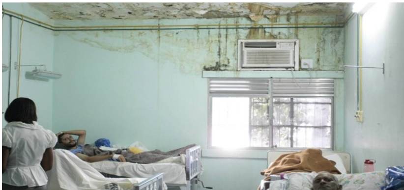
Figure 2: Hospital da Posse em Nova Iguaçu, RJ

The photo bellows illustrates the scenario we found in that emergency room. 6