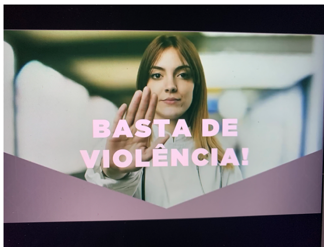
Figure 4: Brazilian Physicians Federal Council

Another big problem is the violence that physicians and other health workers are victims too. In Brazil, this is not different, and the Federal Council of Physicians recently launched a campaign to fight this sort of violence. 14