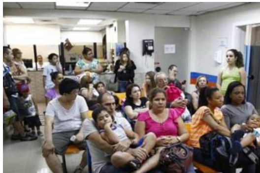
Figure 5: R7 site

not available to all the patients, commonly leads to dissatisfaction for both – professionals and patients. 15