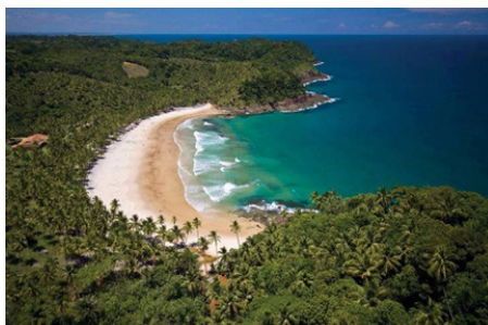
Figure 1: Itacaré, Bahia, Southeast of Brazil.

In the Spring of 2016, my husband and I decided to take a vacation in Itacaré, Bahia, Southeast of Brazil. The paradisiac beaches were breathtaking!